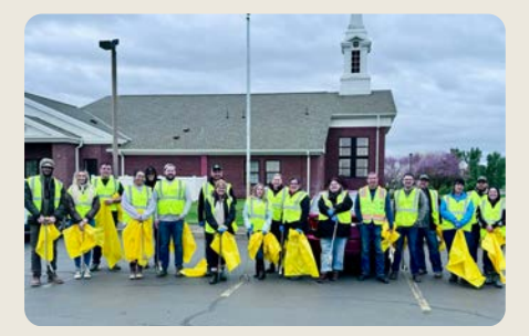
April Highway Cleanup Crew

In 2024, First Federal's team clocked up an impressive 3,200 hours in service to our community! A heartfelt thank you to our dedicated crew for their ongoing support of local nonprofits in Yamhill County. A standout amongst our various volunteer events has to be the biannual Amity highway cleanup. This muchanticipated event has not only become a valued tradition within our team, but it also serves as a brilliant team-building exercise that contributes to a tidier highway!