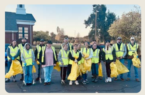
October Highway Cleanup Crew